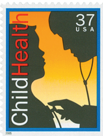
This stamp was issued for children's health awareness.