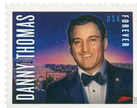
Stamp issued for Thomas's 100th birthday in 2012.

In addition to raising funds for the hospital, Thomas continued to work on television and in commercials. He worked until his death on February 6, 1991.