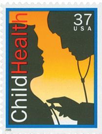
This stamp was issued for children's health awareness.

Early in his career, Thomas struggled to find work and needed to support his young family. He made a plea to St. Jude, the patron saint of the hopeless: "Show me my way in life, and I will build you a shrine." Within a year, he was a successful nightclub entertainer in Chicago.