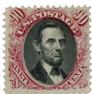
Featuring a Brady portrait, this was the only bi-color portrait stamp until 1918.

Mathew Brady was born around 1822 in Warren County, New York, at a time when photography itself was still a dream waiting to be realized. As a young man, Brady moved to New York City and became fascinated by the emerging art of the daguerreotype—a photographic process that created detailed images on polished metal plates. He studied under Samuel Morse, who was not only the inventor of the telegraph but also an early photography pioneer. Brady quickly mastered the craft and opened his own studio, where his sharp eye and technical skill earned him widespread praise.