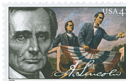
The close-up portrait of Lincoln on this stamp was based on a Brady photo.