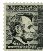
Based on a Brady portrait, this Lincoln stamp was the first in the Prominent Americans Series.

Still, Brady lived long enough to see photography become firmly established as a vital part of journalism and historical record. When he died on January 15, 1896, the nation had begun to recognize the depth of his contribution. Today, his images are among the most valuable and studied photographs in American history. His photographs are now preserved in major institutions such as the Library of Congress, and he has been honored through exhibitions, books, and historical recognition celebrating his role in shaping modern journalism.