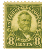
This Grant stamp from the Series of 1922-25 is based on Brady portrait.