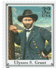
Based on a Brady photo of Grant taken in June 1864 at City Point, Virginia.

By the 1840s and 1850s, Brady was the most famous photographer in the United States. His New York and Washington, DC, studios attracted writers, politicians, and national leaders. He photographed everyone from Edgar Allan Poe to Abraham Lincoln, helping to shape how Americans imagined their public figures. His portraits were formal and serious, reflecting the dignity and gravity people expected from photography at the time. These images helped establish photography as both an art form and a reliable record of reality.