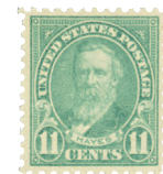
Based on Brady photo taken between 1870 and 1880.