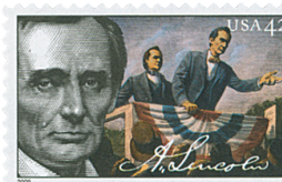
The close-up portrait of Lincoln on this stamp was based on a Brady photo.