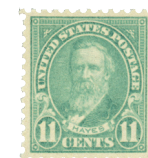
Based on Brady photo taken between 1870 and 1880.