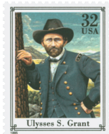
Based on a Brady photo of Grant taken in June 1864 at City Point, Virginia.

By the 1840s and 1850s, Brady was the most famous photographer in the United States. His New York and Washington, DC, studios attracted writers, politicians, and national leaders. He photographed everyone from Edgar Allan Poe to Abraham Lincoln, helping to shape how Americans imagined their public figures. His portraits were formal and serious, reflecting the dignity and gravity people expected from photography at the time. These images helped establish photography as both an art form and a reliable record of reality.