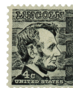
Based on a Brady portrait, this Lincoln stamp was the first in the Prominent Americans Series.

Still, Brady lived long enough to see photography become firmly established as a vital part of journalism and historical record. When he died on January 15, 1896, the nation had begun to recognize the depth of his contribution. Today, his images are among the most valuable and studied photographs in American history. His photographs are now preserved in major institutions such as the Library of Congress, and he has been honored through exhibitions, books, and historical recognition celebrating his role in shaping modern journalism.