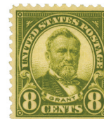
This Grant stamp from the Series of 1922-25 is based on Brady portrait.