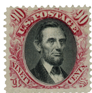
Featuring a Brady portrait, this was the only bi-color portrait stamp until 1918.

Mathew Brady was born around 1822 in Warren County, New York, at a time when photography itself was still a dream waiting to be realized. As a young man, Brady moved to New York City and became fascinated by the emerging art of the daguerreotype—a photographic process that created detailed images on polished metal plates. He studied under Samuel Morse, who was not only the inventor of the telegraph but also an early photography pioneer. Brady quickly mastered the craft and opened his own studio, where his sharp eye and technical skill earned him widespread praise.