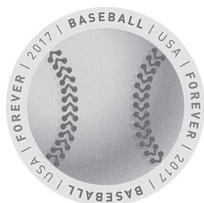
From the 2017 Have a Ball Issue