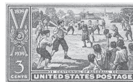
This stamp was issued in 1939 for the 100th anniversary of the beginning of baseball.