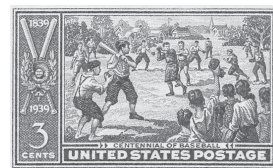
This stamp was issued in 1939 for the 100th anniversary of the beginning of baseball.