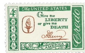
Issued on January 11, 1961