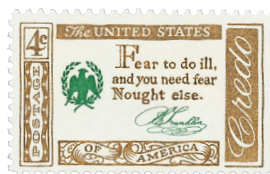
Issued on March 31, 1960