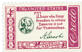
Issued on November 19, 1960