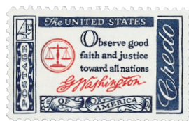
Stamp issued on this day in 1960 in Mount Vernon, Virginia.

stamps were designed to resemble colonial currency. Also, symbols that relate to the statement are used in the designs, as well as a likeness of the author’s signature.