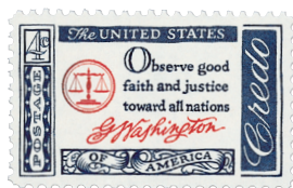
Stamp issued on this day in 1960 in Mount Vernon, Virginia.

stamps were designed to resemble colonial currency. Also, symbols that relate to the statement are used in the designs, as well as a likeness of the author's signature. One hundred distinguished Americans chose the individual principles.