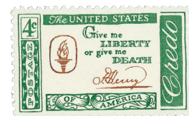
Issued on January 11, 1961