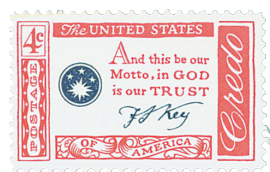
Issued on September 14, 1960