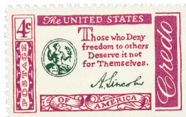
Issued on November 19, 1960