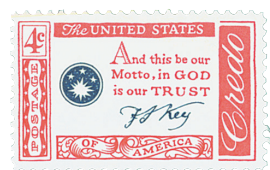
Issued on September 14, 1960