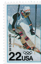
US stamp picturing an alpine skier issued for these games.

The Calgary Games closed on February 28, 1988. In all, more than 1,400 athletes from 57 nations participated in the games. The Soviet Union and East Germany took the most medals overall, while Canada failed to win any gold medals. The Calgary Olympics cost about $829 million. However, because the organizing committee worked out lucrative television and sponsorship deals, they actually made a surplus. They reported $1.4 billion in benefits throughout Canada as a result of the games. Additionally, the venues they built for the games remained in use and helped establish the area as the center of Canada's winter sports industry.