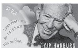
Arlen and Harburg wrote a number of songs together, most notably, “Over the Rainbow.”

In 1929, a composer convinced Arlen to write music for one of his piano pieces, which with the lyrics of Ted Koehler became the song “Get Happy.” It was his first well-known song. He also started writing shows the popular Harlem night club, the Cotton Club. Arlen began working for a music publishing company and produced the songs “Between the Devil and the Deep Blue Sea” and “I’ve Got the World on a String.” Arlen produced scores for the Broadway musicals You Said It , Life Begins at 8:40 , Hooray for What? , Bloomer Girl , St. Louis Woman , and Saratoga .