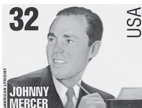
Arlen collaborated with Mercer on several songs, including "One for My Baby" and "Come Rain or Shine."

By the mid-1930s, Arlen began spending more time in California, writing songs for musical films. He soon began partnering with lyricist "Yip" Harburg on a number of songs. In 1938, the pair were hired to compose the songs for The Wizard of Oz . The most famous song from the film, "Over the Rainbow," earned the pair an Academy Award for Best Original Song.