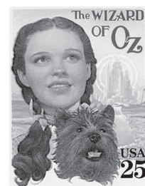
"Over the Rainbow" was voted the #1 song of the 20th century.

Arlen began working for a music publishing company and produced the songs "Between the Devil and the Deep Blue Sea" and "I've Got the World on a String." Arlen produced scores for the Broadway musicals You Said It, Life Begins at 8:40, Hooray for What?,