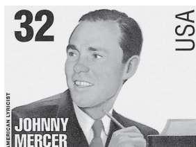
Arlen collaborated with Mercer on several songs, including “One for My Baby” and “Come Rain or Shine.”

Arlen wrote a number of other songs for Hollywood films including, “It’s Only a Paper Moon,” “Let’s Fall in Love,” “That Old Black Magic,” and Groucho Marx’s theme song, “Lydia the Tattoo’d Lady.” Other popular Arlen songs include: “Blues in the Night,” “Come Rain or Come Shine,” “One for my Baby,” “I Love a Parade,” and “Stormy Weather.”