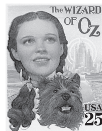
“Over the Rainbow” was voted the #1 song of the 20th century.

By the mid-1930s, Arlen began spending more time in California, writing songs for musical films. He soon began partnering with lyricist “Yip” Harburg on a number of songs. In 1938, the pair were hired to compose the songs for The Wizard of Oz . The most famous song from the film, “Over the Rainbow,” earned the pair an Academy Award for Best Original Song.