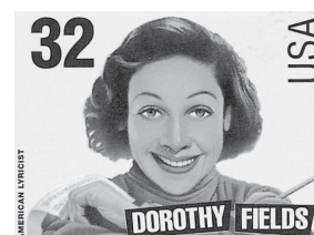
Arlen collaborated with Dorothy Fields on The Farmer Takes a Wife .

In 1950s, Arlen composed Judy Garland’s other famous song, “The Man that Got Away,” with lyrics by Ira Gershwin, for the movie A Star is Born . At her notable Carnegie Hall concert in 1961 Garland thanked Arlen personally for the song and he received a standing ovation.