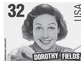
Arlen collaborated with Dorothy Fields on The Farmer Takes a Wife .

In 1950s, Arlen composed Judy Garland's other famous song, "The Man that Got Away," with lyrics by Ira Gershwin, for the movie A Star is Born . At her notable Carnegie Hall concert in 1961 Garland thanked Arlen personally for the song and he received a standing ovation.