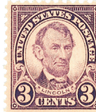
Stamp image based on a photo taken just a few days before Lincoln's 55th birthday.

So the Young Men's Republican Union, whose members included Horace Greeley and Hamilton Fish, invited a group of more moderate candidates to address a New York audience. Among the choices were Frank Blair, Cassius Clay, and Abraham Lincoln. Lincoln knew full well that his speech, if successful, could lead to a nomination, and even the presidency.