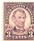
Stamp image based on a photo taken just a few days before Lincoln's 55th birthday.

So the Young Men's Republican Union, whose members included Horace Greeley and Hamilton Fish, invited a group of more moderate candidates to address a New York audience. Among the choices were Frank Blair, Cassius Clay, and Abraham Lincoln. Lincoln knew full well that his speech, if successful, could lead to a nomination, and even the presidency.