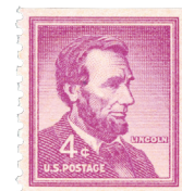
Stamp issued at Fort Abraham Lincoln in North Dakota.

The focus of Lincoln's speech was slavery. He spent months researching to prove that the framers of the Constitution believed that the federal government should regulate the adoption of slavery in new territories.