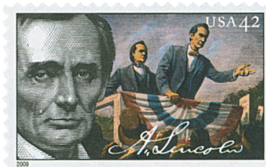
The black and white portrait on this stamp is based on a photo by Matthew Brady taken on the afternoon of the Cooper Union Address.

But Lincoln's audience embraced him once he got started and "his face lighted up as with an inward fire; the whole man was transfigured. I forgot his clothes, his personal appearance, and his individual peculiarities. Presently, forgetting myself, I was on my feet like the rest...cheering for this wonderful man."