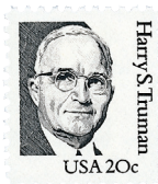
From the Great Americans Series

Joined on stage by President Harry Truman, Churchill began his "Sinews of Peace" speech by thanking and praising the United States. He then promoted his belief that the US and Britain develop an even closer relationship to help police the postwar world. Churchill then issued a warning against the Soviet Union's expansion and compared it to Adolph Hitler's rise before World War II. He went on to warn that with the Soviets there was "nothing which they admire so much as strength, and there is nothing for which they have less respect than for military weakness."