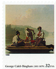
From the Four Centuries of American Art sheet

Following his father's death in 1823, Bingham worked as a school janitor to help make money for the family. He then apprenticed with two cabinetmakers while considering a future as a minister or lawyer. But he never gave up on his art, and by the age of 19 was painting portraits for $20 each. He was a quick painter as well, often able to complete a full portrait in just one day.