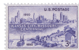
Bingham held several offices in Kansas City during his career.

After his study in Düsseldorf ended, Bingham returned to America and resumed his popular portrait painting. He soon had less time for painting though, as he took on a series of political posts including State Treasurer of Missouri, president of the Kansas City Board of Police Commissioners, and Adjutant-General of Missouri. In his later years Bingham suffered a number of health issues, but served as the first Professor of Art of the University of Missouri.