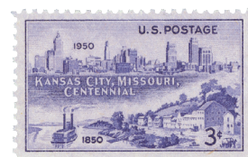
Bingham held several offices in Kansas City during his career.

After his study in Düsseldorf ended, Bingham returned to America and resumed his popular portrait painting. He soon had less time for painting though, as he took on a series of political posts including State Treasurer of Missouri, president of the Kansas City Board of Police Commissioners, and Adjutant-General of Missouri. In his later years Bingham suffered a number of health issues, but served as the first Professor of Art of the University of Missouri.