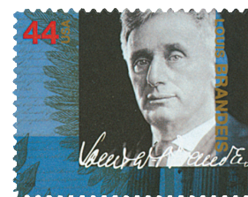
Acheson clerked for Supreme Court Justice Louis Brandeis for three years.