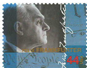
As a professor at Harvard, Felix Frankfurter inspired Acheson to be a better student.

After Acheson graduated, Frankfurter recommended Supreme Court Justice Louis Brandeis take him on as a clerk. Acheson worked under Brandeis from 1919 to 1921. He then worked at a law firm in Washington, DC, until 1933. At that time, President Franklin Roosevelt made him undersecretary of the Treasury. However, when the secretary became sick, Acheson became acting secretary, and found he didn't have the knowledge or experience to do the job. Additionally, he disagreed with Roosevelt's plans to deflate the dollar, so he resigned after less than a year.