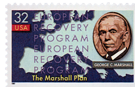
Acheson implemented Marshall Plan in 1948.