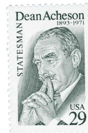
Stamp issued for Acheson's 100th birthday.

Acheson resigned from the State Department on Truman's last day in office, January 20, 1953. He then joined the Yale board of trustees, was a fellow in the American Academy of Arts and Sciences, and returned to practicing law. Practicing out of Washington, DC, he served as an unofficial advisor to Presidents John F. Kennedy, Lyndon B. Johnson, and Richard Nixon. In 1964, Acheson won the Presidential Medal of Freedom and in 1968, he helped to engineer the US withdrawal from the Vietnam conflict. In 1970, he received the Pulitzer Prize for history for Present at the Creation: My Years in the State Department , published in 1969.