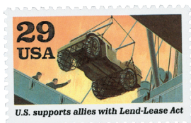
Acheson oversaw the WWII Lend-Lease Act.