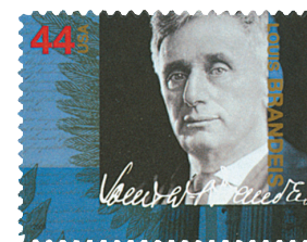
Acheson clerked for Supreme Court Justice Louis Brandeis for three years.