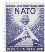
Acheson negotiated the treaty that established NATO in 1949.