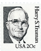
Acheson served as Truman's secretary of State from 1949-53. Truman said he was the best person to ever hold that office.

Acheson resigned from the State Department on Truman's last day in office, January 20, 1953. He then joined the Yale board of trustees, was a fellow in the American Academy of Arts and Sciences, and returned to practicing law. Practicing out of Washington, DC, he served as an unofficial advisor to Presidents John F. Kennedy, Lyndon B. Johnson, and Richard Nixon. In 1964, Acheson won the Presidential Medal of Freedom and in 1968, he helped to engineer the US withdrawal from the Vietnam conflict. In 1970, he received the Pulitzer Prize for history for Present at the Creation: My Years in the State Department , published in 1969.