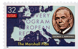
Acheson implemented Marshall Plan in 1948.