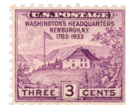
Issued for the 150th anniversary of the proclamation of peace, this stamp pictures his headquarters at the Hasbrouck House in Newburgh, New York.

News of these preliminary agreements took time to cross the Atlantic. Communication depended on ships, which could take weeks or months to arrive. By early 1783, word had reached North America that a ceasefire had been agreed upon. On April 11, Congress formally proclaimed a cessation of hostilities. Washington then issued his own orders to the army on April 18, 1783, to ensure that the message reached his troops clearly and directly.