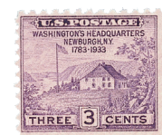
1935 Farley's Follies Special Printing issued Without Gum

At the time, the Continental Army was still encamped along the Hudson River. Many soldiers had not been paid for months, and tensions were high. Just weeks earlier, in March 1783, officers had gathered in what became known as the