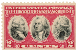
Yorktown 150th Anniversary Stamp picturing Count de Rochambeau, General George Washington, and Count de Grasse

Formal steps toward peace began with the signing of preliminary articles between American and British representatives on November 30, 1782. These articles outlined the basic terms of independence. The United States would be recognized as a sovereign country. Boundaries were defined, stretching from the Atlantic Ocean to the Mississippi River. Americans were granted fishing rights off the coast of Newfoundland, and provisions were included regarding debts owed to British creditors and the treatment of Loyalists.