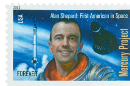
Issued for the 50th anniversary of Shepard's flight.

Shepard himself would not fly again until 1971, when he commanded the Apollo 14 mission to the Moon. However, his 1961 flight remained a foundational moment. It provided data on human performance, spacecraft control, and recovery procedures. These lessons directly supported later programs, including Gemini and Apollo.