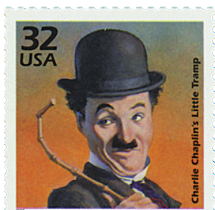
Chaplin was a close friend and ally throughout Fairbanks's career.

After leaving school at the age of 15, Fairbanks joined Frederick Warde's acting troupe. For two years he traveled the country acting and working as assistant stage manager. Fairbanks then left the group hoping to find success on Broadway. He had his first role there in Her Lord and Master in 1902. Fairbanks appeared in a number of Broadway plays in the coming years, including the popular A Gentleman From Mississippi . In between Broadway appearances, Fairbanks worked in a hardware store and as a clerk in a Wall Street office.