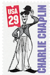
Chaplin stamp from the Silent Screen Stars set