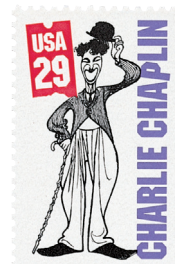
Chaplin stamp from the Silent Screen Stars set