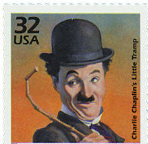
Chaplin was a close friend and ally throughout Fairbanks's career.

After leaving school at the age of 15, Fairbanks joined Frederick Warde's acting troupe. For two years he traveled the country acting and working as assistant stage manager. Fairbanks then left the group hoping to find success on Broadway. He had his first role there in Her Lord and Master in 1902. Fairbanks appeared in a number of Broadway plays in the coming years, including the popular A Gentleman From Mississippi . In between Broadway appearances, Fairbanks worked in a hardware store and as a clerk in a Wall Street office.