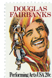
Issued on Fairbanks's 101st birthday.

Fairbanks' declining health and the introduction of "talkies" in the late 1920s and '30s brought about the decline of his career. Though he continued to act in talking films through 1934, he never achieved the same success he had with silent films. Fairbanks died on December 12, 1939, with his last words being, "I've never felt better."