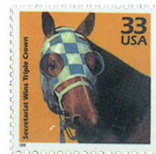
Secretariat was featured on the 1970s Celebrate the Century sheet.

Secretariat retired after 1973 and sired a number of other successful racehorses, about 600 in all. He died at age 19 on October 4, 1989.