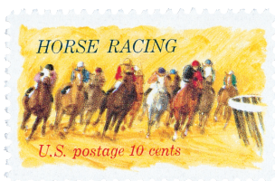
Issued for the 200th anniversary of the Kentucky Derby.