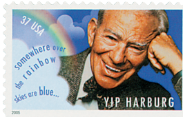
Yip Harburg and Harold Arlen wrote "Over the Rainbow," which became Garland's signature song.

Not long after, Garland joined her two sisters, Susie and Jimmie, who performed song and dance routines as the Gumm Sisters in theaters and social functions around Grand Rapids. Then in 1926, the Gumm family bought a theater in Lancaster, California. There the girls appeared on radio, in theaters, and at nightclubs, and soon had a loyal following. Garland made her film debut in 1929 at the age of seven in a short titled, The Big Revue . In 1934, they changed their name to the Garland Sisters, and Frances became known as Judy.