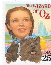
From the 1990 Classic Films issue