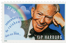
Yip Harburg and Harold Arlen wrote "Over the Rainbow," which became Garland's signature song.

Not long after, Garland joined her two sisters, Susie and Jimmie, who performed song and dance routines as the Gumm Sisters in theaters and social functions around Grand Rapids. Then in 1926, the Gumm family bought a theater in Lancaster, California. There the girls appeared on radio, in theaters, and at nightclubs, and soon had a loyal following. Garland made her film debut in 1929 at the age of seven in a short titled, The Big Revue . In 1934, they changed their name to the Garland Sisters, and Frances became known as Judy.