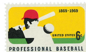
Stamp issued for the 100th anniversary of professional baseball.