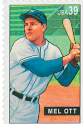
These stamps picture baseball sluggers that are all in the hall of fame.