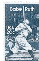
Stamp issued for the 50th anniversary of the All-Star Game.