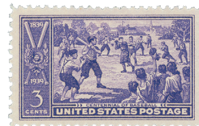
This stamp was issued in Cooperstown on the museum's opening day.

In the years since, the Baseball Hall of Fame, often referred to as simply Cooperstown, has become the home of baseball. Over the years, more than 300 people have been inducted, with honorees joining every year.