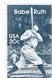
Stamp issued for the 50th anniversary of the All-Star Game.