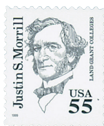
From the Great Americans Series

Morrill introduced his first land-grant bill to Congress in 1857. Its purpose was to offer a course of study that wasn't based on either abstract liberal arts or on military science, which were the primary focuses of higher education during the 1800s.