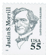
From the Great Americans Series

Morrill introduced his first land-grant bill to Congress in 1857. Its purpose was to offer a course of study that wasn't based on either abstract liberal arts or on military science, which were the primary focuses of higher education during the 1800s.