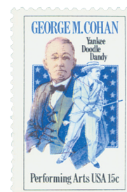
Stamp issued on Cohan’s 100th birthday.

George M. Cohan died in New York City on November 5, 1942. His reputation continued after his death. James Cagney portrayed him in the 1942 film Yankee Doodle Dandy , which introduced Cohan’s music to a new generation. Cohan was later honored with a statue in Times Square, near the heart of Broadway. It remains a fitting tribute to a performer who helped give American musical comedy its own voice.