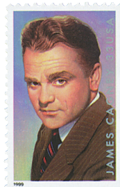
James Cagney won an Academy Award for his portrayal of Cohan in Yankee Doodle Dandy.