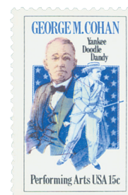
Stamp issued on Cohan’s 100th birthday.

George M. Cohan died in New York City on November 5, 1942. His reputation continued after his death. James Cagney portrayed him in the 1942 film Yankee Doodle Dandy , which introduced Cohan’s music to a new generation. Cohan was later honored with a statue in Times Square, near the heart of Broadway. It remains a fitting tribute to a performer who helped give American musical comedy its own voice.