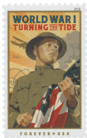
Stamp issued to mark the 100th anniversary of US involvement in WWI.

The first battle began on September 6, 1914, with 150,000 French soldiers in the 6th Army attacking the German 1st Army's right flank. The 1st German Army had turned to meet the attack, leaving a 30-mile gap between them and the 2nd Army. The combined French and British assault filled the gap and attacked the German 2nd Army. On September 7, a corps of 6,000 more French soldiers were rushed from Paris by taxicab to relieve the exhausted army. This was immediately followed by a surprise attack on the German 2nd Army by the French 5th, and led to the Germans' retreat that same day.