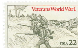
This stamp image was based on a sketch by Captain Harvey Dunn of US troops at the Second Battle of the Marne.

The Allies pushed the German forces back over the next few days before setting up entrenchments near the Aisne River, which would remain well into 1918. The battle ended on September 13, with German General Helmuth von Moltke telling the Kaiser, "Your Majesty, we have lost the war." The First Battle of the Marne is remembered for being one of the most decisive battles in history. It marked the beginning of the end of Germany's two-front war strategy.