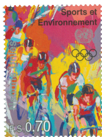
Geneva office OLYMPHILEX '96 United Nations stamps