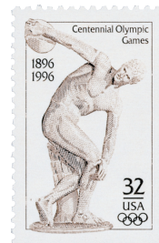
Issued on this day in 1996

The UN also issued stamps at OLYMPHILEX '96 that were designed by sports artist Leroy Neiman.