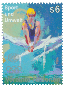
Vienna office OLYMPHILEX '96 United Nations stamps