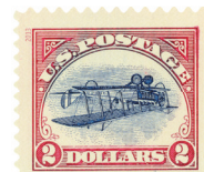
From a sheet issued to mark the opening of the William H. Gross Gallery in 2013.

In 1997, the National Postal Museum hosted an inaugural ball for Vice President Al Gore. That same year, it received full status as a Smithsonian Institution National Museum. Then, in 2013, the National Postal Museum opened the world's largest stamp gallery – the William H. Gross Stamp Gallery, named for its main benefactor. The 12,000-square-foot facility houses some of the greatest stamp rarities and is a mecca for collectors around the world.