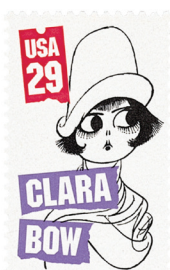
Silent actress Clara Bow was one of the inspirations for Betty Boop