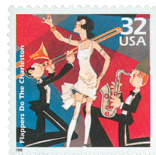
Betty was styled as a jazz-aged flapper

The last Betty cartoon was released in 1939, but since then, she's enjoyed several "comebacks" and appearances in such hit movies as Who Framed Roger Rabbit .