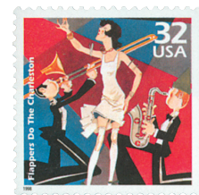
Betty was styled as a jazz-aged flapper

The last Betty cartoon was released in 1939, but since then, she's enjoyed several "comebacks" and appearances in such hit movies as Who Framed Roger Rabbit .