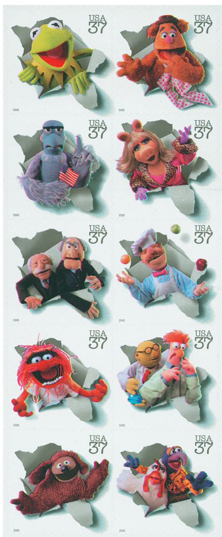
Muppets stamps issued to mark Kermit the Frog's 50th anniversary.