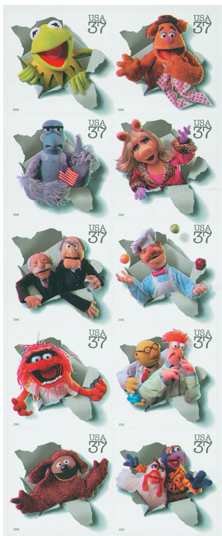
Muppets stamps issued to mark Kermit the Frog's 50th anniversary.