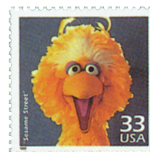
Stamp pictures Big Bird – one of Henson's creations.