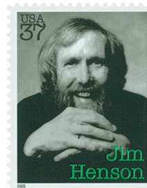
Stamp pictures a 1986 photo of Jim Henson.

In 1990, Henson was working on a multimedia attraction for Disney theme parks when he died suddenly on May 16, 1990. According to Henson's wishes, his funeral was to be a celebration, where no one wore black. The day included a performance by Big Bird singing "It's Not Easy Bein' Green" and ended with several Muppet performers and their Muppets singing "Just One Person."