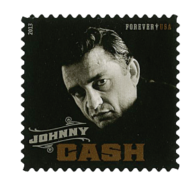
the mid-to-late 1940s.

Just a few years later, in the early 1920s, Virginia created a Future Farmers