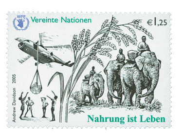
2005 Vienna stamps issued for World Food Day

Vereinte Nationen € 0.55 Nahrung ist Leben