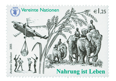
2005 Vienna stamps issued for World Food Day

malnutrition in order to develop their physical and mental faculties." They also made a commitment to resolve these issues within a decade. At a summit in 1996, they acknowledged that they hadn't achieved this goal, but set out to do so in the 21st century.