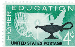
Issued to honor the role of higher education in the development of the United States.