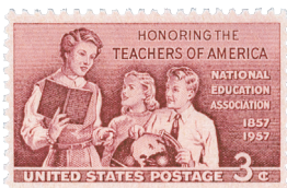
Issued to honor America's teachers.

At a time when few women received even basic instruction, Lyon determined to learn as much as she could. She began teaching when she was just 17 years old and soon realized she needed more education herself. Lyon said she gained “knowledge by the handfuls,” by attending lectures and taking courses at colleges for men (sometimes a three-day trip). As she continued to learn and teach, she began envisioning a school that offered rigorous academics and was available to women from all walks of life.