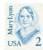
Issued on Lyon's 190th birthday.

Today, Mount Holyoke College (it was renamed in 1893) has more than 2,000 students enrolled and is still known for its strong academic program. Mount Holyoke College offers two years of general education in liberal arts and two years of concentrated studies in one of twenty-four academic areas.