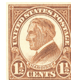
This stamp was never distributed to post offices. It was only available at the Philatelic Agency in Washington, DC.