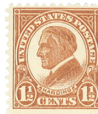
The first fractional US postage stamp.

On the way back to the lower 48 states, Harding toured British Columbia, the first sitting president to visit Canada. As the trip continued, Harding became progressively weaker. On August 2, Harding died in San Francisco of an apparent heart attack. The president's body was transported by train across the country. Millions of Americans lined the track all along the route to pay their respects. His state funeral took place on August 8 in the Capitol building. Harding's term was the shortest of any president in the 20th century.