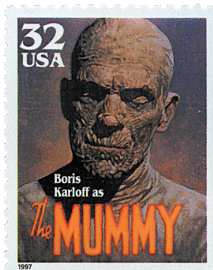
Stamp depicting Boris Karloff as the Mummy.