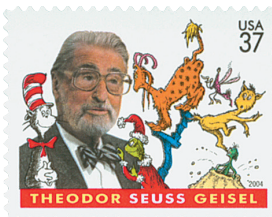
Stamp issued for Dr. Seuss's 100th birthday.

While continuing to appear in films, Karloff returned to the stage in 1941 for Arsenic and Old Lace . Later in the decade, he had his own radio and television series, Starring Boris Karloff . And in 1950, he played Captain Hook in a stage production of Peter Pan , for which he received a Tony Award nomination.