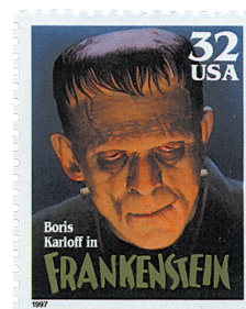
From the Classic Movie Monsters issue

Karloff continued to act in his final years before dying on February 2, 1969, in Sussex, England.