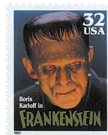
From the Classic Movie Monsters issue

Karloff continued to act in his final years before dying on February 2, 1969, in Sussex, England.