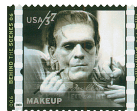
From the American Filmmaking set