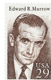
Sevareid credited Murrow as the man who “invented” him.