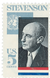
Sevareid interviewed Stevenson just days before his death in 1965.

Fleeing from France, Sevareid next reported on the Battle of Britain from the bombed-out streets of London. Sevareid continued to cover World War II, reporting on the Italian campaign, and camping with Tito and his Yugoslavian followers. Sevareid was with the first Americans to land in France, and stayed with them all the way to Germany. On his way to Asia to cover the war there, the plane he was on developed engine trouble and became disabled. He and the others onboard had to parachute into a Burmese jungle, behind enemy lines. The US Army Air Forces sent a search and rescue team that was able to locate the group.