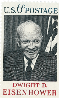
Stamp issued seven months after Eisenhower died.