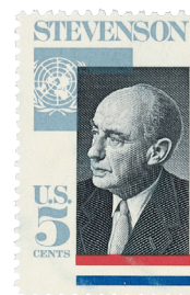
Stevenson lost to Eisenhower again in the 1956 election.