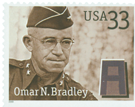
From the Distinguished Soldiers issue