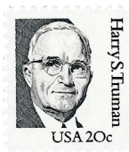
From the Great Americans Series