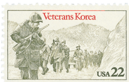
Based on 1950 photo of US troops retreating from Chosin Reservoir.