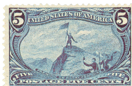
Trans-Mississippi stamp picturing Fremont in the Rockies.

In 1842 a chance encounter with explorer John C. Fremont made Carson an active participant in extending the boundaries of the continental US. Carson served as a guide for three of Fremont's government-financed expeditions until 1846, when he joined up with General Stephen W. Kearny, whose command was heading for California with presidential orders to take over the region. Alternately fighting and scouting, he earned a reputation for bravery, loyalty, and devotion to duty.