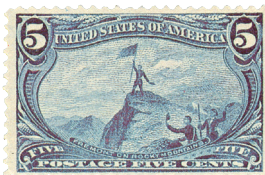
Trans-Mississippi stamp picturing Fremont in the Rockies.

In 1842 a chance encounter with explorer John C. Fremont made Carson an active participant in extending the boundaries of the continental US. Carson served as a guide for three of Fremont's government-financed expeditions until 1846, when he joined up with General Stephen W. Kearny, whose command was heading for California with presidential orders to take over the region. Alternately fighting and scouting, he earned a reputation for bravery, loyalty, and devotion to duty.