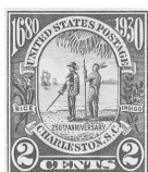
The train and rail line were developed to help Charleston's struggling economy.

After construction was complete, the locomotive was disassembled and sent by boat to Charleston, arriving in October 1830. The Best Friend of Charleston made its inaugural run on Christmas Day, December 25, 1830. On that day, it pulled a passenger train along a six-mile route. With this, the Best Friend of Charleston became the first American-built steam locomotive to haul a train of passenger cars on a public railroad.