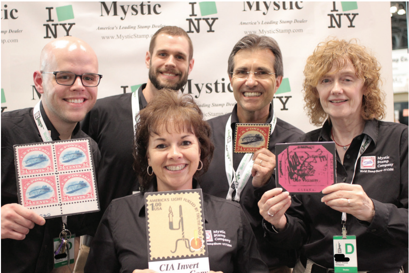
Mystic colleagues and I had a great time at the 2016 NY Stamp Show. We made these jumbo replicas of stamp rarities for collectors to take pictures with – it was a lot of fun!