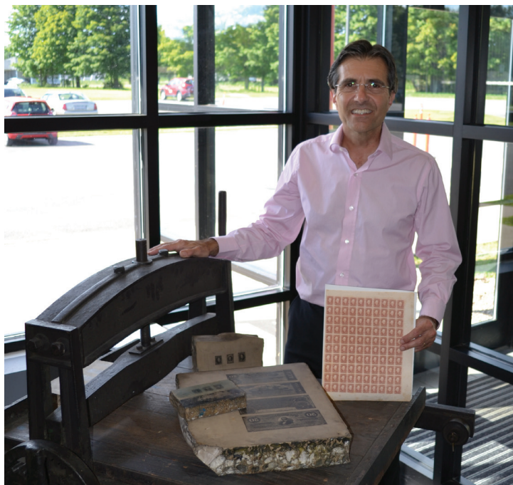
Me with Mystic's Confederate stamp printing press and lithography stones – priceless pieces of history.